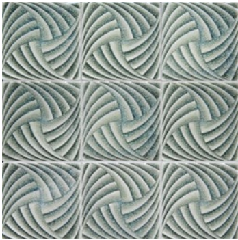
Stream crackle (C)