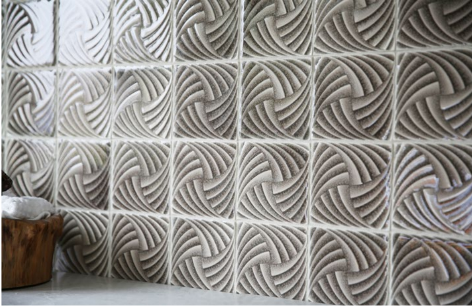
Pewter crackle (C)