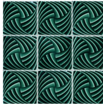
Brazil crackle (C)