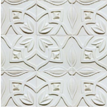
Begin with a Bianca base.

Reference your Jewel Multi sample board to choose from 1 of 4 color groups, or visit https://encoreceramics.com/jewel-multi/