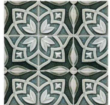
We'll combine the colors to create a jewel multi. Aegean-Cortez jewel multi.