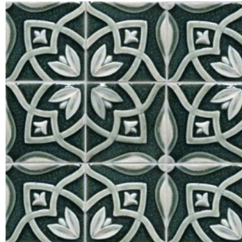
Choose color B: Cortez.