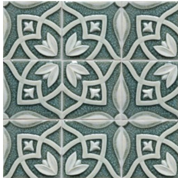
Choose color A: Aegean.